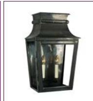
(513A) - Page 129