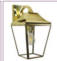
(591O) - Page 83