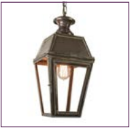
(431H) - Page 46