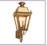
(425P3) - Page 20