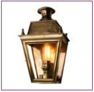
(425F) - Page 32