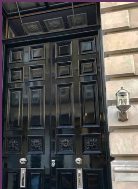
Featured Model 471 (N) Page 50 Luxury Mansion Block, Knightsbridge – UK