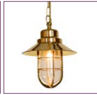
(448) - Page 63