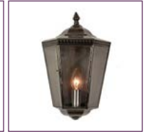
(434) - Page 54