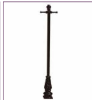
(LP03) - Page 148