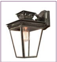
(491O) - Page 72