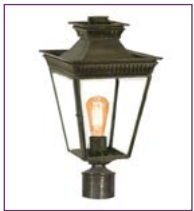
(491PM) - Page 81