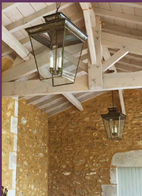
Featured Model 492A (AB) Page 44 County Estate, Côte d'Azur – France