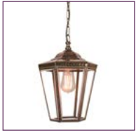
(435) - Page 55