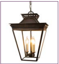
(492BP3) - Page 77