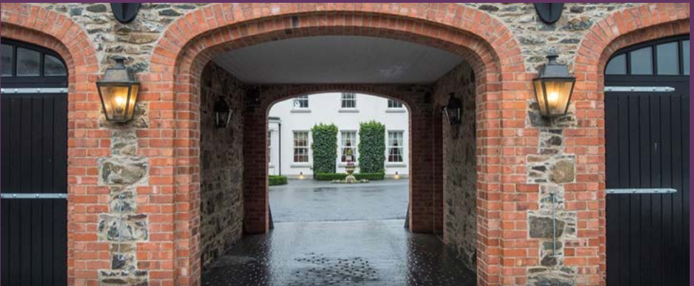
Featured Model: 425AF (ANT) Page 65 The Coach House Boutique B&B, Dromore – Northern Ireland