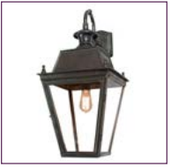
(425AO) - Page 25