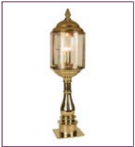
(471P) - Page 67