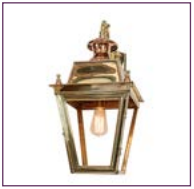
(425O) - Page 23