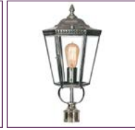
(433PM) - Page 58