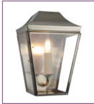
(593) - Page 90