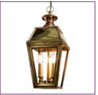
(431HP3) - Page 47