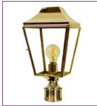
(591PM) - Page 92