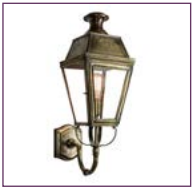
(431) - Page 42