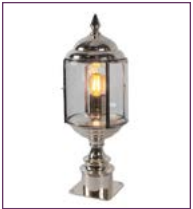
(471SP) - Page 66