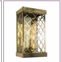
(532A) - Page 131