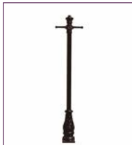
(LP02) - Page 147