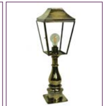
(591P) - Page 85