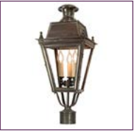
(425P3PM) - Page 39