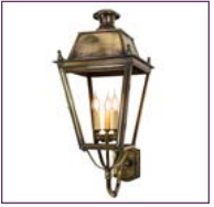
(425AP3) - Page 22