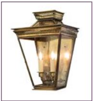
(493A) - Page 80