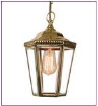
(482) - Page 94