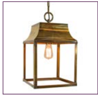
(463B) - Page 110