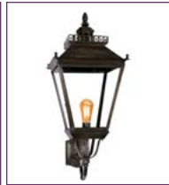
(502A) - Page 119