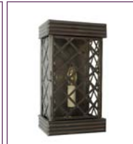
(532) - Page 130