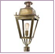
(425PM) - Page 38