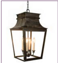
(512AA) - Page 127