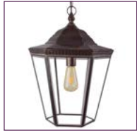
(435A) - Page 56