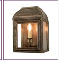
(506) - Page 102