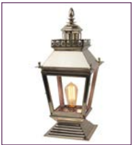
(501) - Page 115