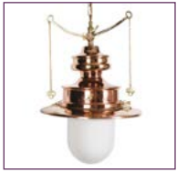
(440) - Page 61