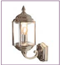
(471) - Page 65