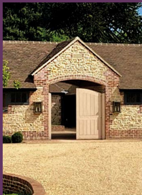
Featured Model 475A (AB) Page 55 Converted Barn, Surrey – UK