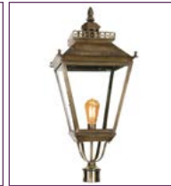
(502APM) - Page 122