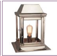
(464) - Page 112