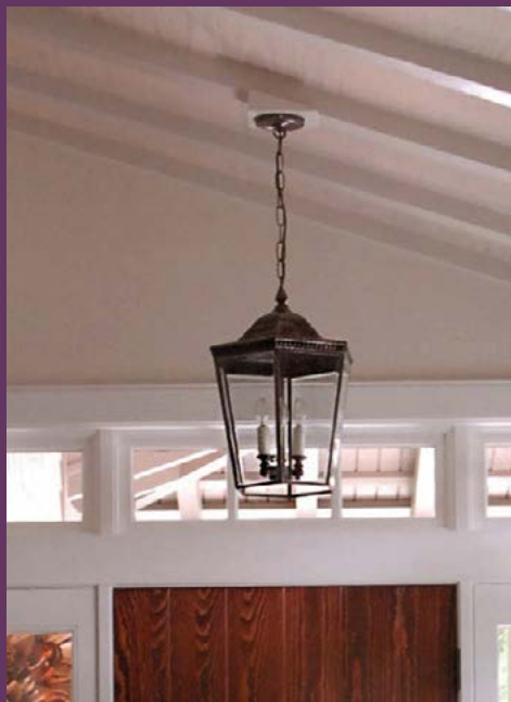
Featuring model 435AP3 (ANT) Page 48 Beach House, Connecticut – USA