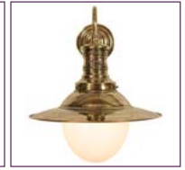
(437W) - Page 60