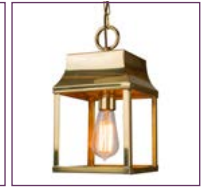
(463) - Page 109