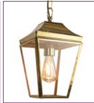
(592) - Page 86