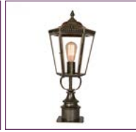
(433SP) - Page 52