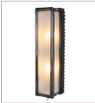
(901M) - Page 141