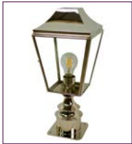
(591SP) - Page 84