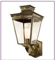
(491) - Page 71