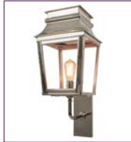
(511) - Page 123