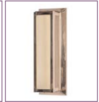
(900M) - Page 135