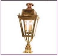
(425SP3) - Page 35