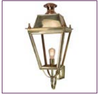
(425A) - Page 21