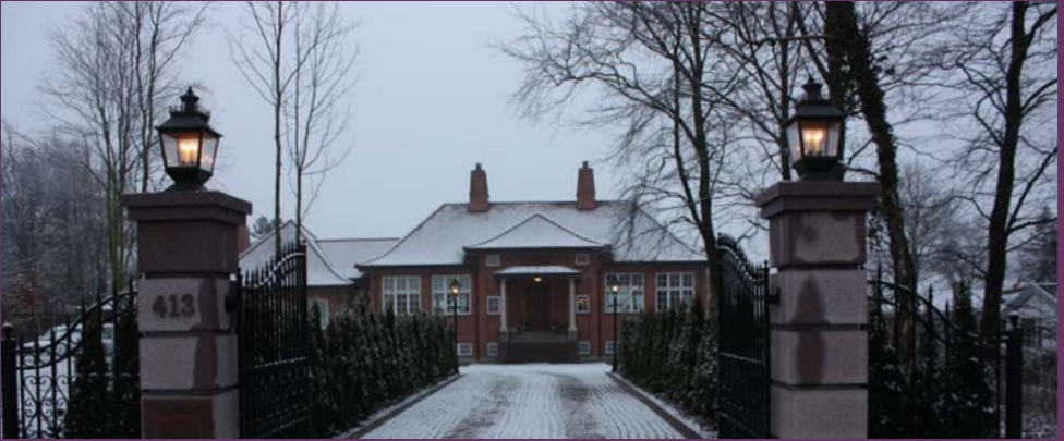
Featured Model 501A (ANT/REL) Page 57 New Build Mansion, Oslo – Norway