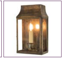
(462) - Page 106