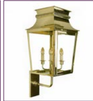
(511A) - Page 124