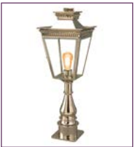
(491PM) - Page 74