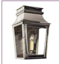
(513) - Page 128