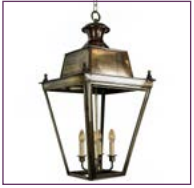
(425AAH) - Page 31