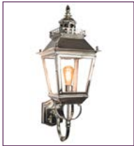
(502) - Page 118