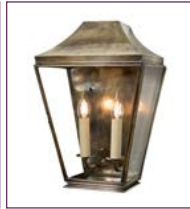
(593A) - Page 91