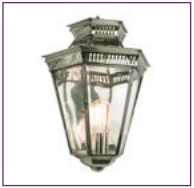
(413) - Page 17