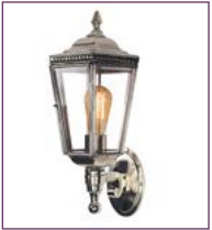
(481) - Page 93