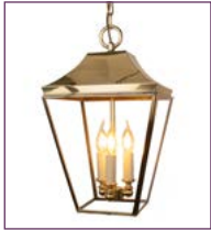
(592BP3) - Page 88