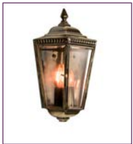
(483) - Page 95