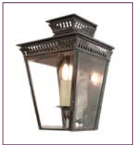
(493) - Page 79