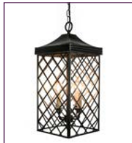
(533A) - Page 133