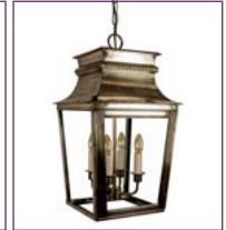
(512A) - Page 126