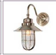
(448W) - Page 64