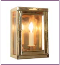
(475) - Page 96