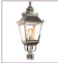
(502PM) - Page 121