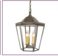
(435AP3) - Page 57