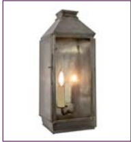
(504) - Page 98