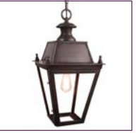
(425AH) - Page 29