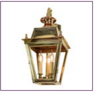
(425OP3) - Page 24