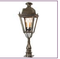
(425PP3) - Page 37