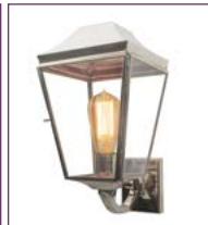
(591) - Page 82