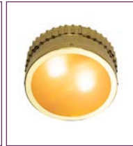
(901RS) - Page 144