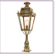
(425P) - Page 36