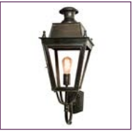
(425) - Page 19