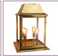
(464A) - Page 114