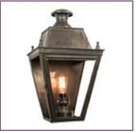
(425AF) - Page 33