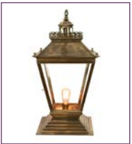
(501B) - Page 116