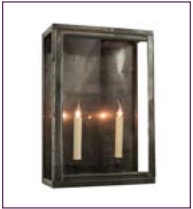
(475A) - Page 97