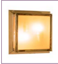
(900SQ) - Page 137