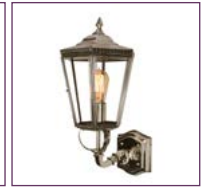
(433) - Page 50