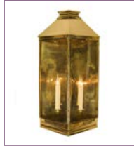
(504A) - Page 99