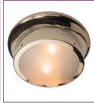
(900RS) - Page 138