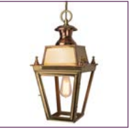
(425H) - Page 27