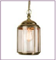
(472) - Page 68