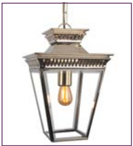
(492) - Page 75