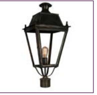
(425APM) - Page 40