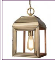
(505) - Page 100