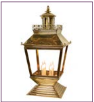
(501A) - Page 117