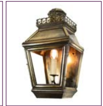
(503) - Page 120