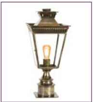
(491SP) - Page 73