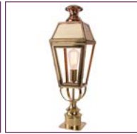
(431SP) - Page 44