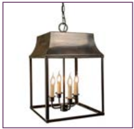
(463A) - Page 111