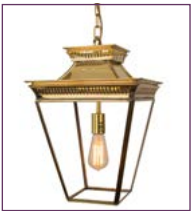
(492B) - Page 76