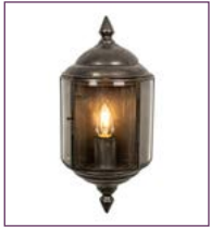
(473) - Page 69