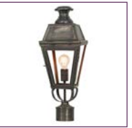
(431PM) - Page 49