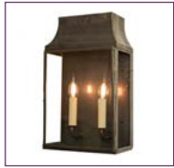
(462B) - Page 107