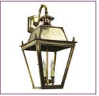
(425AOP3) - Page 26