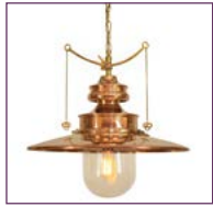
(440L) - Page 62