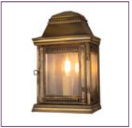
(414) - Page 18