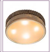
(901RL) - Page 145