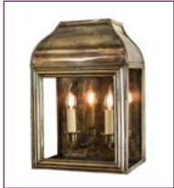
(506A) - Page 103