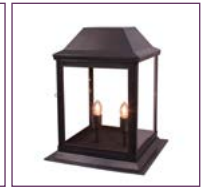
(464B) - Page 113