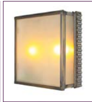
(901SQ) - Page 143