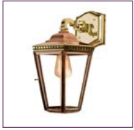
(433O) - Page 51