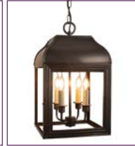
(505A) - Page 101