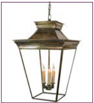
(492A) - Page 78