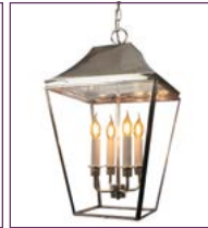
(592A) - Page 89