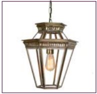
(410) - Page 16