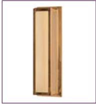
(900L) - Page 136