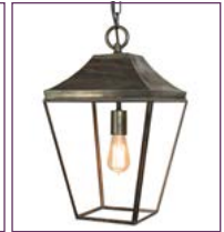
(592B) - Page 87