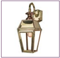
(431O) - Page 43