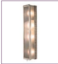
(901L) - Page 142