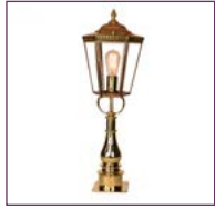
(433P) - Page 53