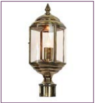
(471PM) - Page 70