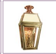
(432) - Page 48