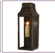
(462S) - Page 104