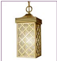
(533) - Page 132