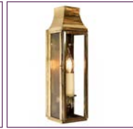
(462SA) - Page 105