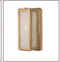
(901S) - Page 140