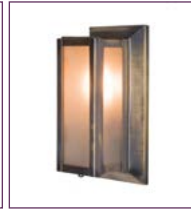
(900S) - Page 134