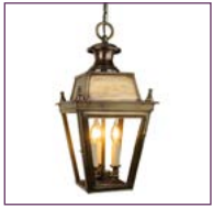
(425HP3) - Page 28