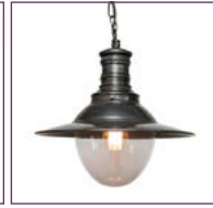
(437) - Page 59