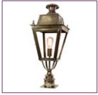
(425SP) - Page 34