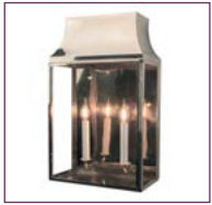
(462A) - Page 108