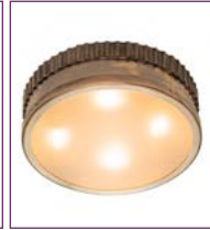
(900RL) - Page 139