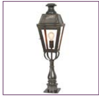
(431P) - Page 45