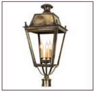
(425AP3PM) - Page 41