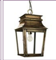
(512) - Page 125